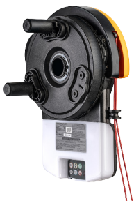
Operator with LED Courtesy Light