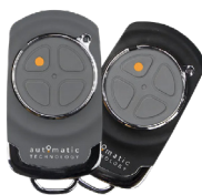
Wireless wall button + 2x TrioCode™ 128 Remote Controls